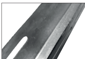
PROCESS ONE Corrosion resistant raw material, often referred to as Zintec