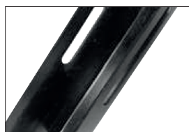
PROCESS THREE ED coating process: electrophoretic deposition (aka ED or EPD) coating