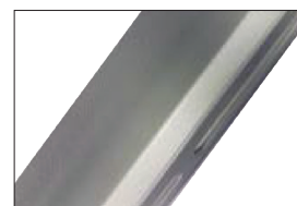
PROCESS FOUR Epoxy polyester powder coating